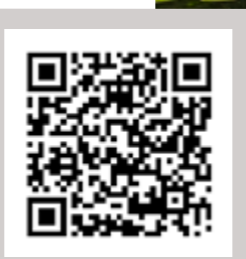
TECHNICAL DATA SHEET