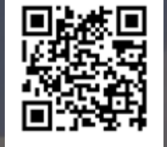
MORE INFO IN VIDEO