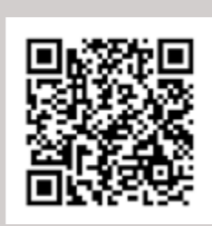
TECHNICAL DATA SHEET